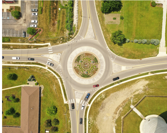
Aerial view of roundabout in Carmel, Indiana. (see more examples in Appendix V)

Action Item 1.2 Select one to three intersections for a model program to test the viability and effectiveness of roundabouts at appropriate intersections in University Park, with the goal of reducing congestion and improving traffic flow.